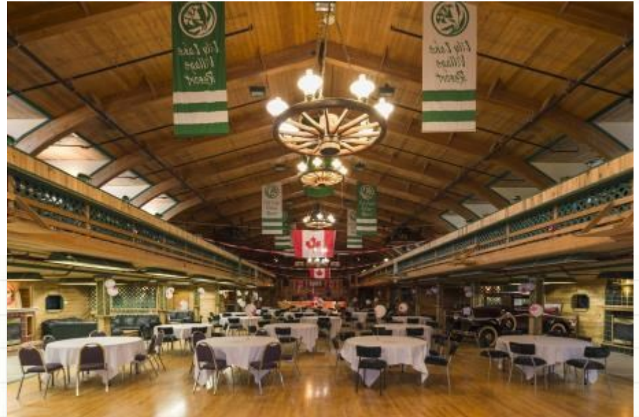
*The “Old Red Barn” at Bon Accord Interior – Lily Lake Acres