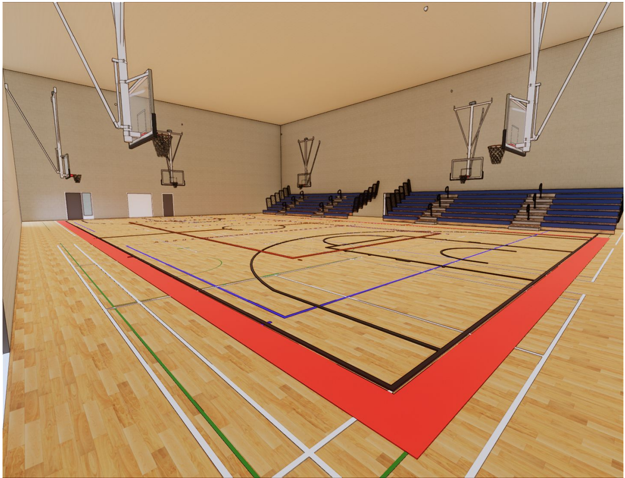
Appendix C: Visualization of expanded gymnasium