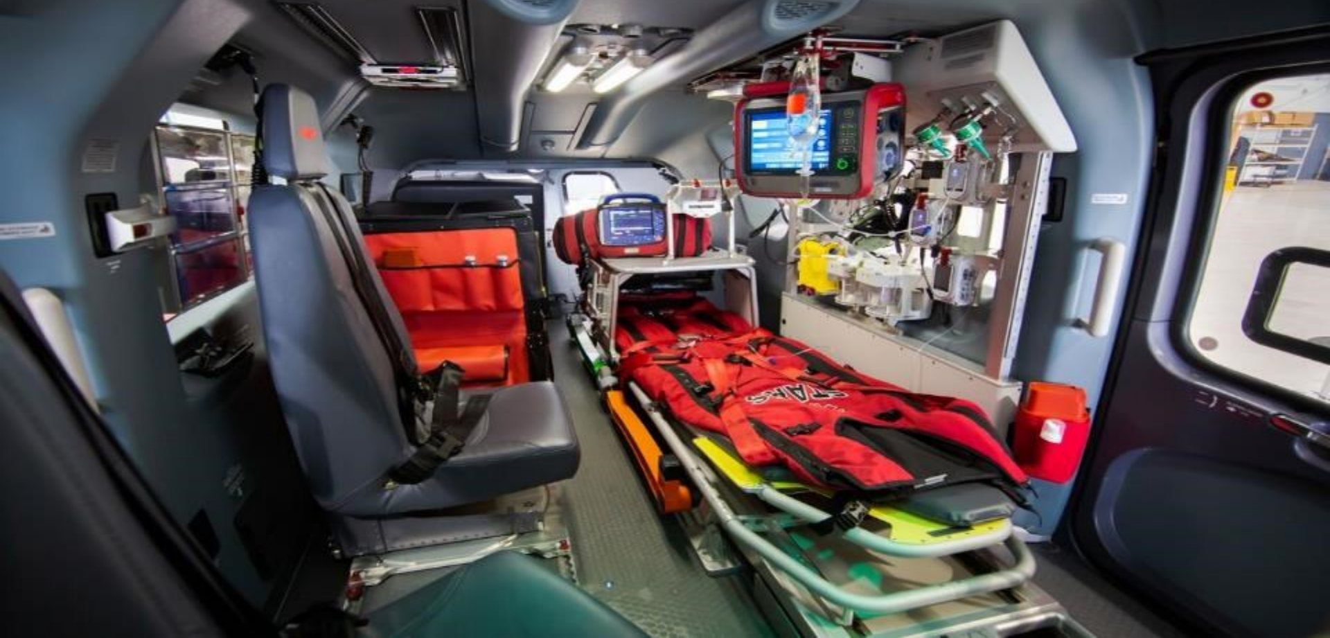
AIRBUS H145 – AIRBORNE INTENSIVE CARE UNIT (ICU)