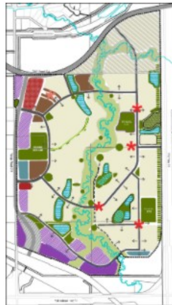
Approved Cambrian Crossing Area Structure Plan