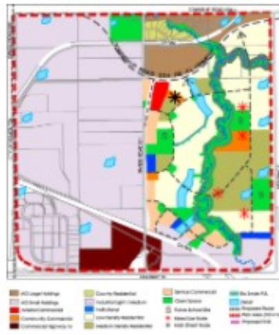
Approved North of Yellowhead Area Concept Plan