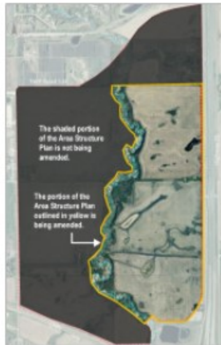
Portion of Cambrian Crossing Area Structure Plan Being Amended

The Cambrian Crossing Area Structure Plan encompasses approximately 365 hectares of land, located at the north-western corner of Highway 16 and Highway 21. The plan area abuts the C.N.R. railway line to the south, the realigned Township Road 534 forms the northern boundary, and Range Road 231/Clover Bar Road forms the western boundary.