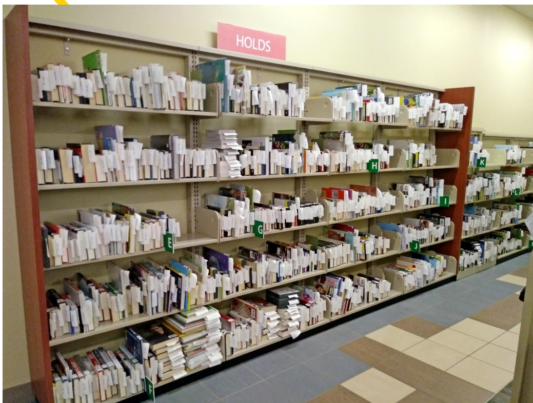
Holds shelves were overflowing!