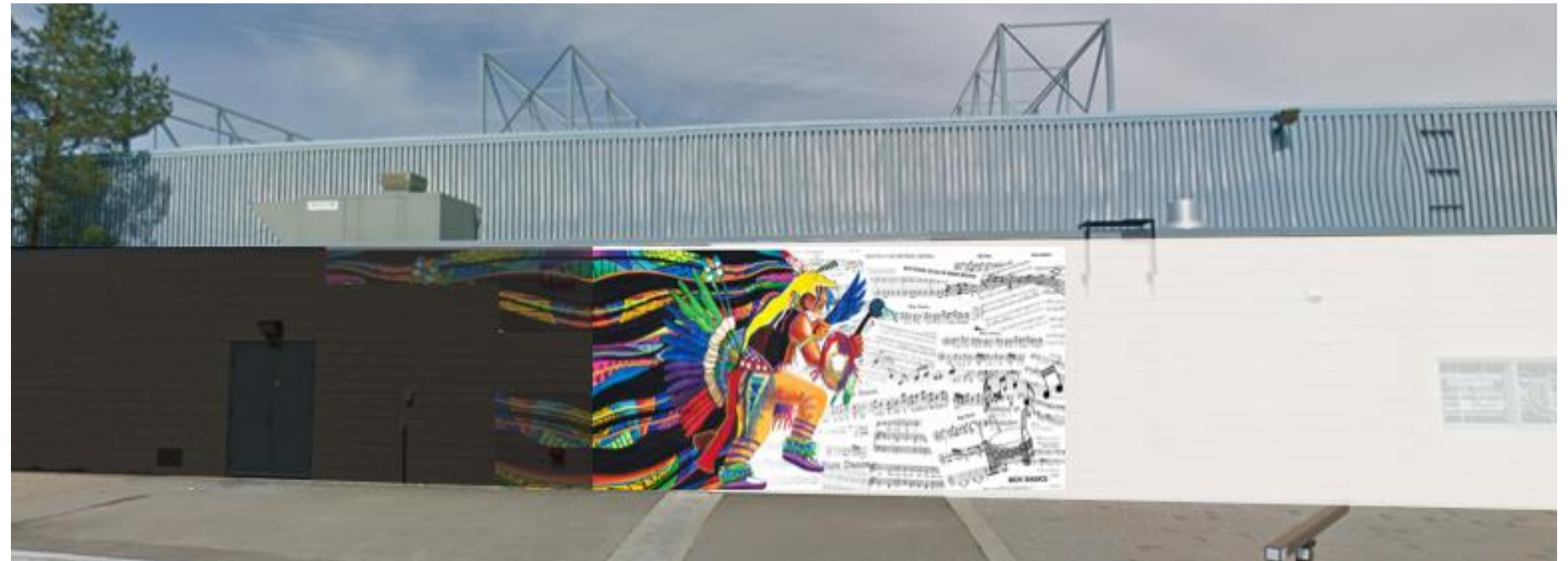
Rough mock-up of mural on Sherwood Park Arena