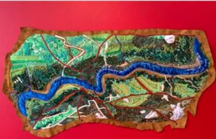
N. Saskatchewan River, Edmonton