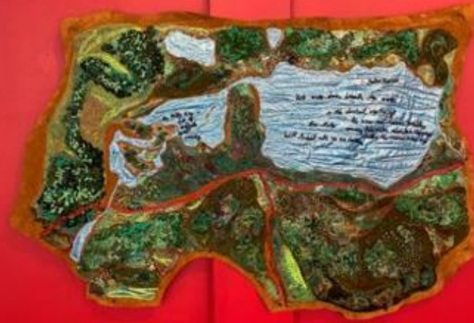
Lac Ste. Anne