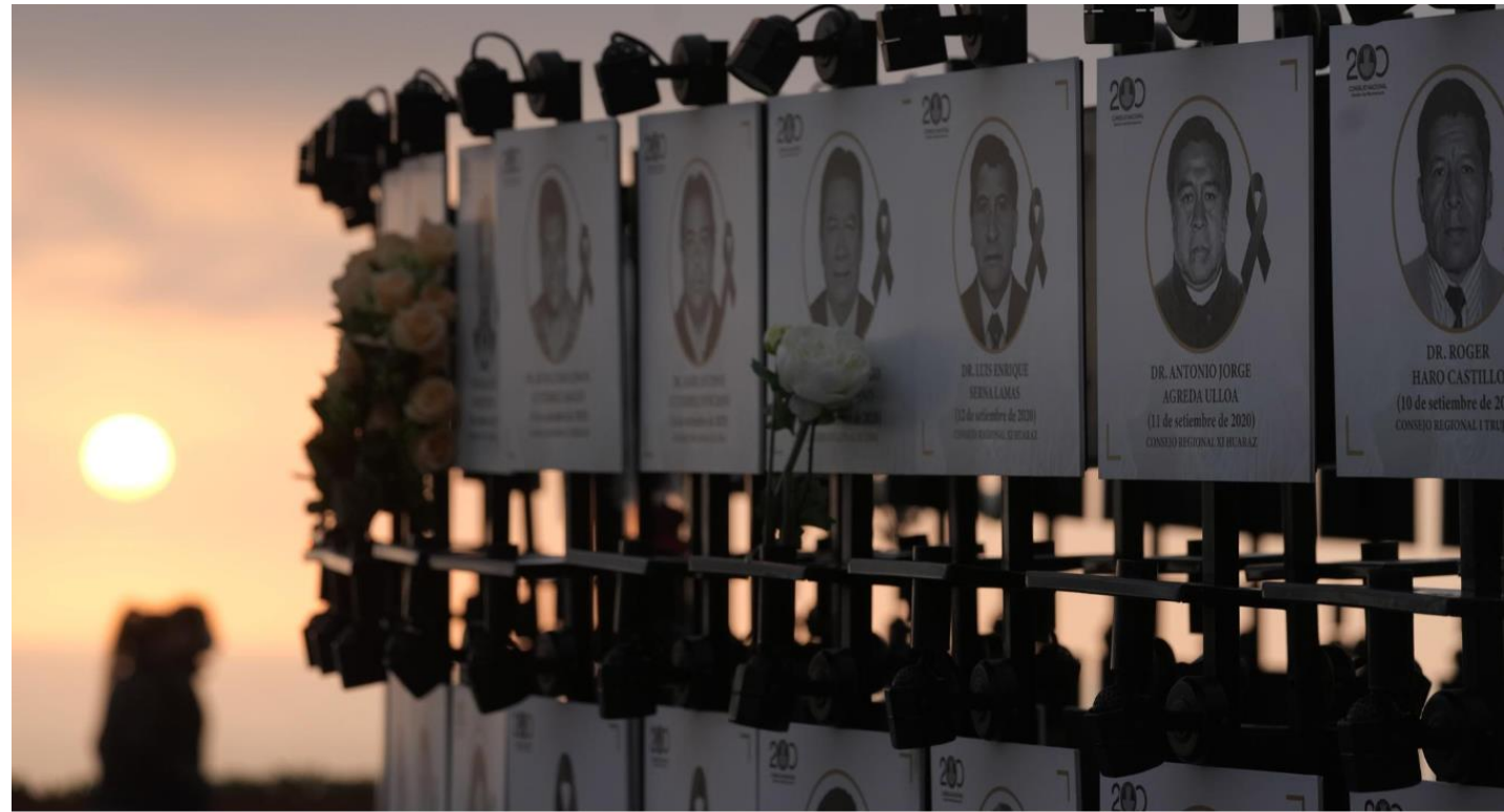
Doctor's Memorial in Lima, Peru.