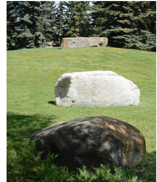
BLP – Sound Garden