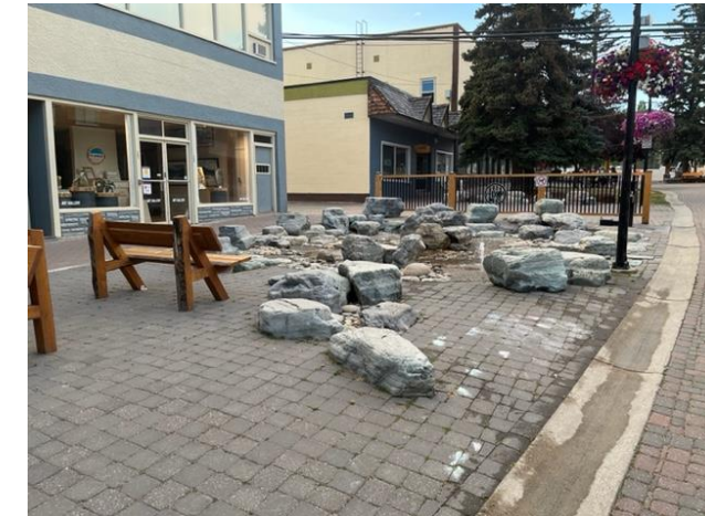
Water Feature – Kimberly, BC