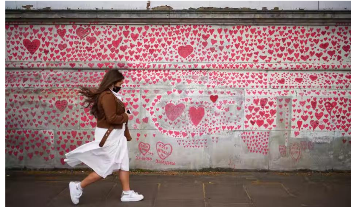
National COVID Memorial Wall in London, UK