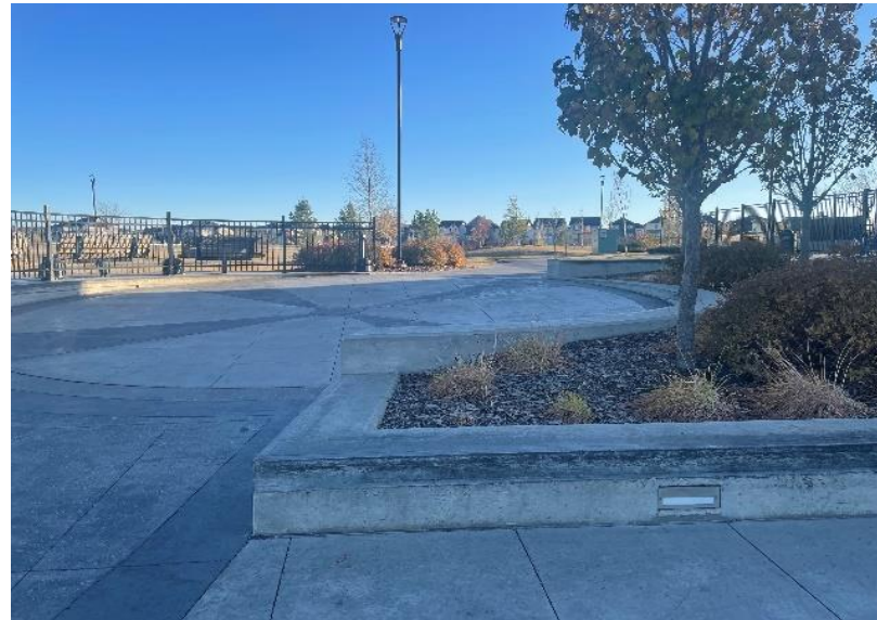
Emerald Hills Regional Park