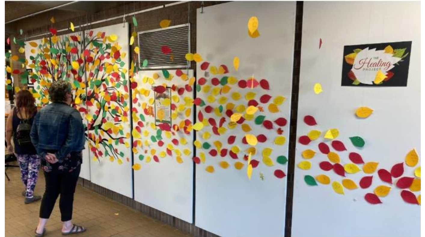
“The Healing Project” at St. Albert Place.