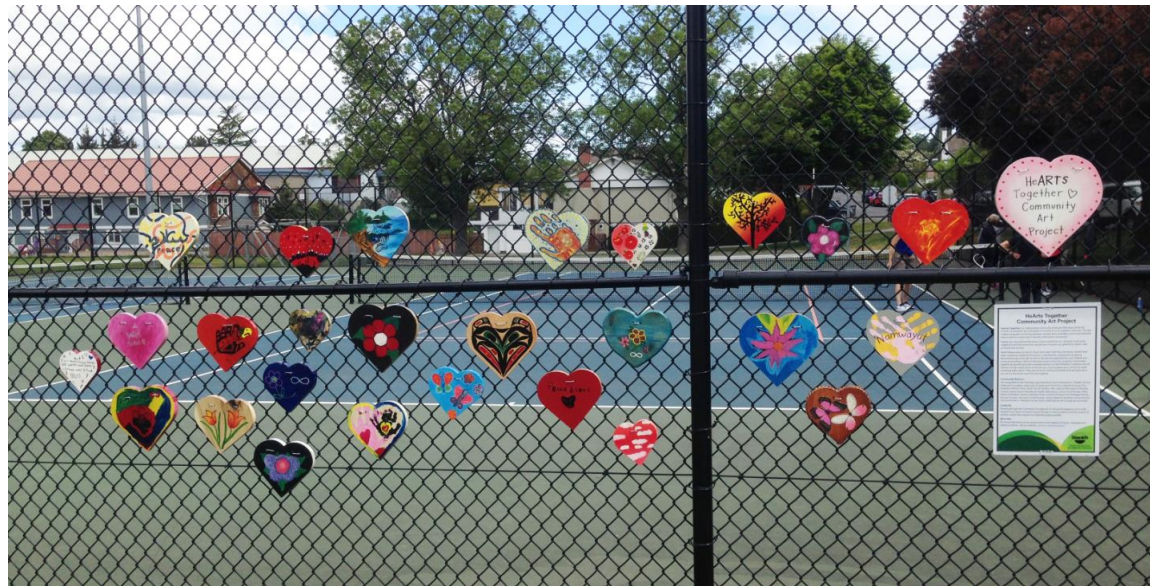
Hearts Together Project - Saanich, BC