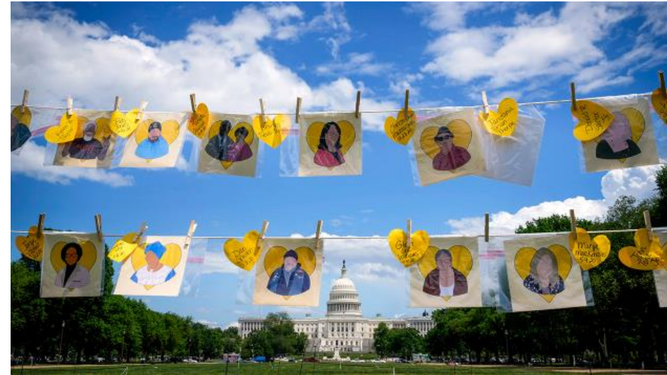
National Mall Project