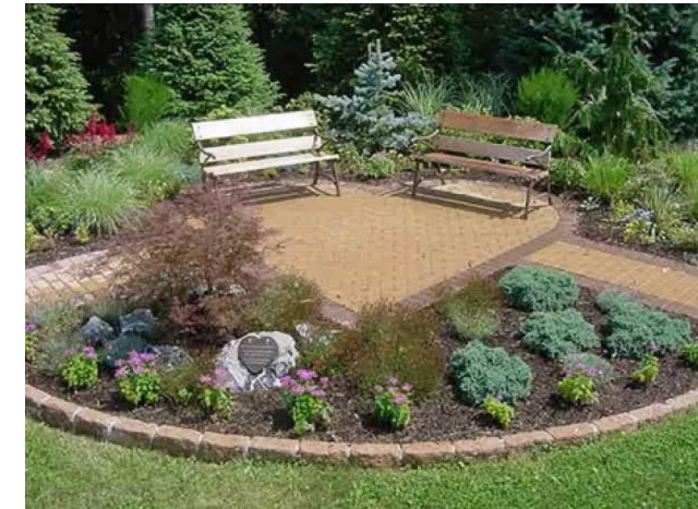
Small Memorial Garden