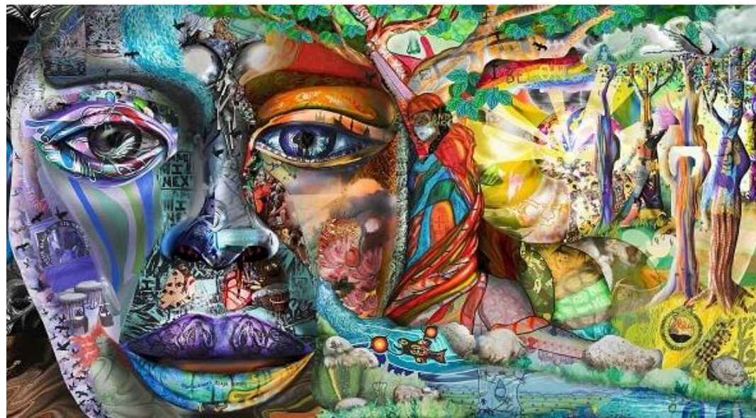
Art in Hard Times- Canadian Red Cross