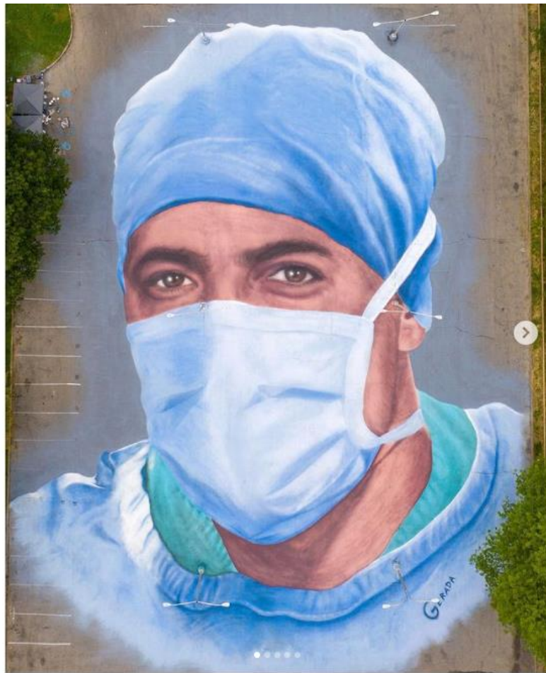
Mural in Flushing Meadows, NY

Some memorials have honoured specific groups impacted by the pandemic.