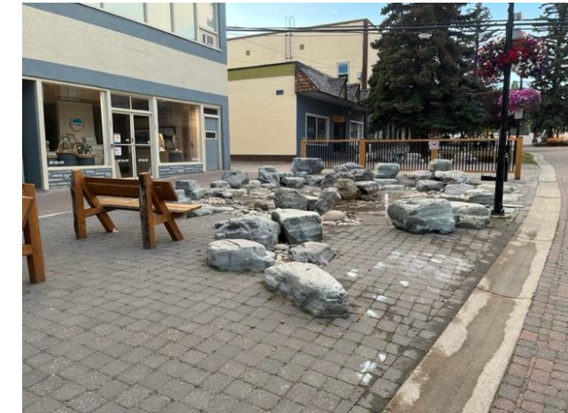
Water Feature – Kimberly, BC