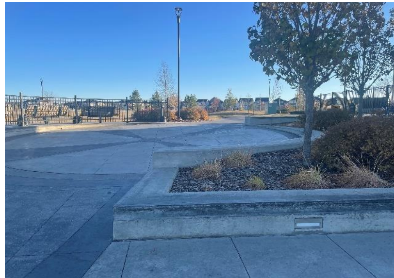
Emerald Hills Regional Park