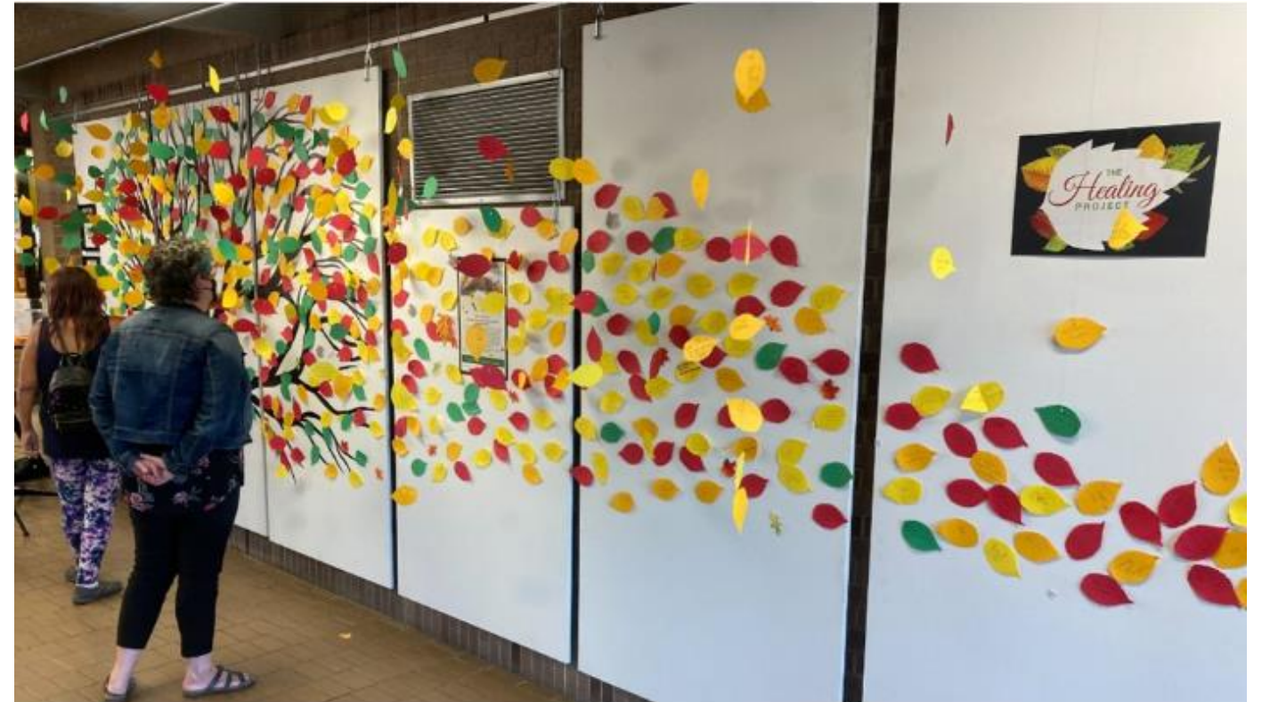
“The Healing Project” at St. Albert Place.