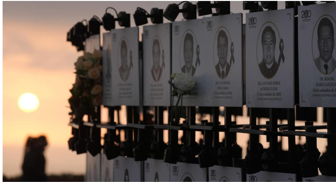
Doctor's Memorial in Lima, Peru.