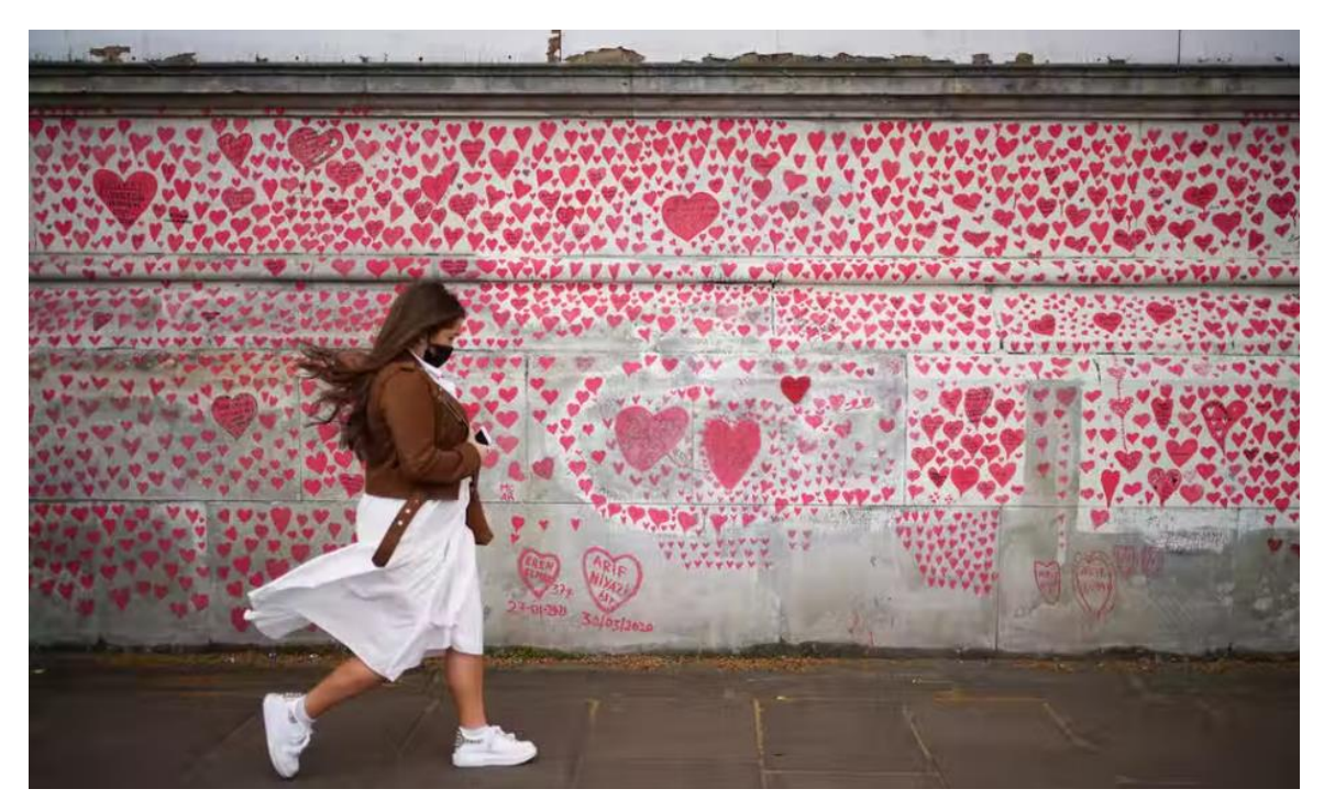
National COVID Memorial Wall in London, UK