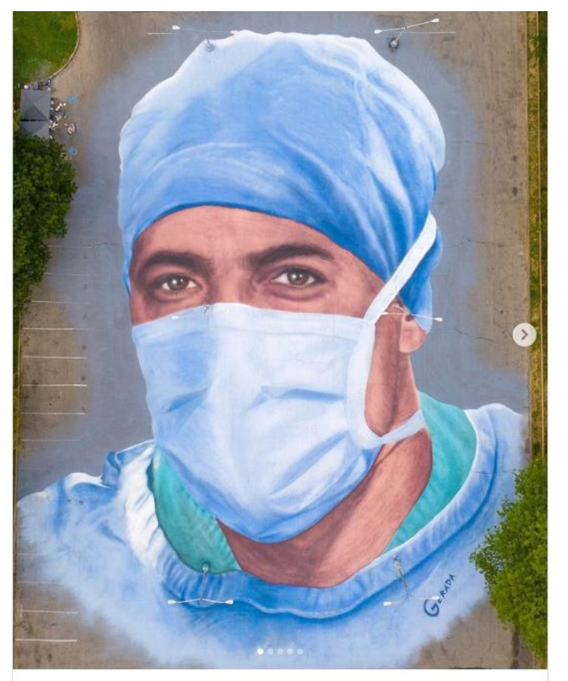
Mural in Flushing Meadows, NY

Some memorials have honoured specific groups impacted by the pandemic.