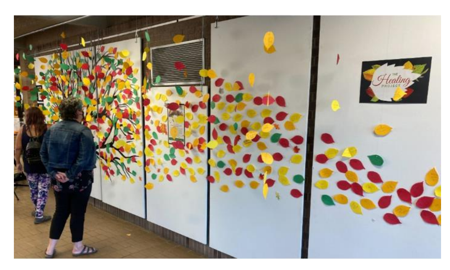
"The Healing Project" at St. Albert Place.