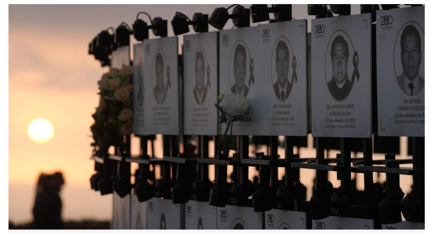
Doctor's Memorial in Lima, Peru.