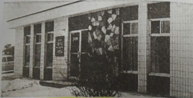
APEX CONCRETE HEAD OFFICE, 5928 98th ST.