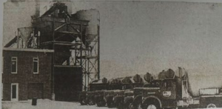
APEX READY MIX CONCRETE TRUCKS

...lined up at new $250,000 plant at 17 St. between 112th - 114th Aves.