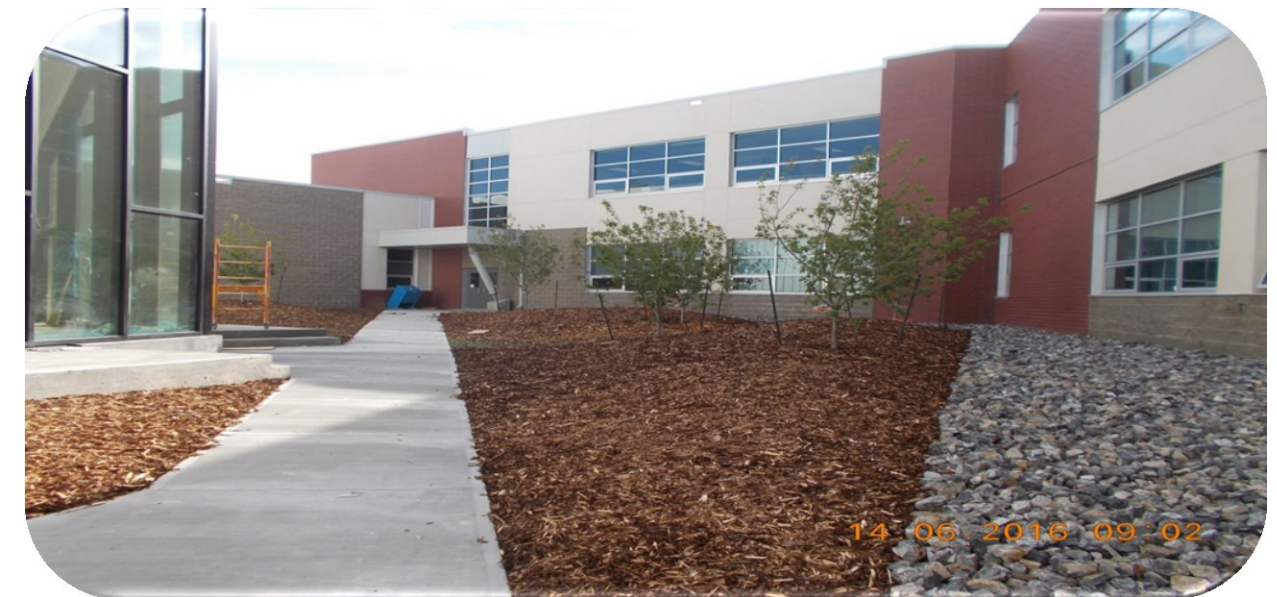
Interior of new facility