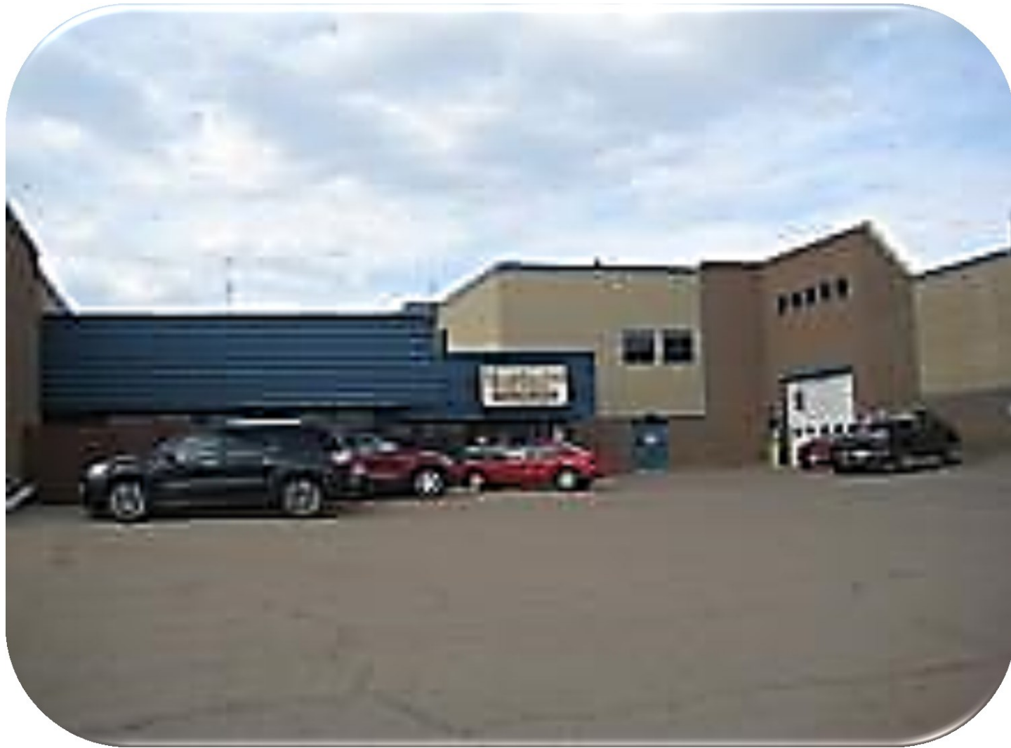
Site of existing facility