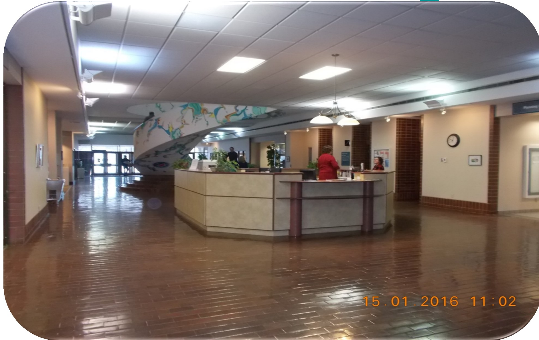
Existing interior of facility