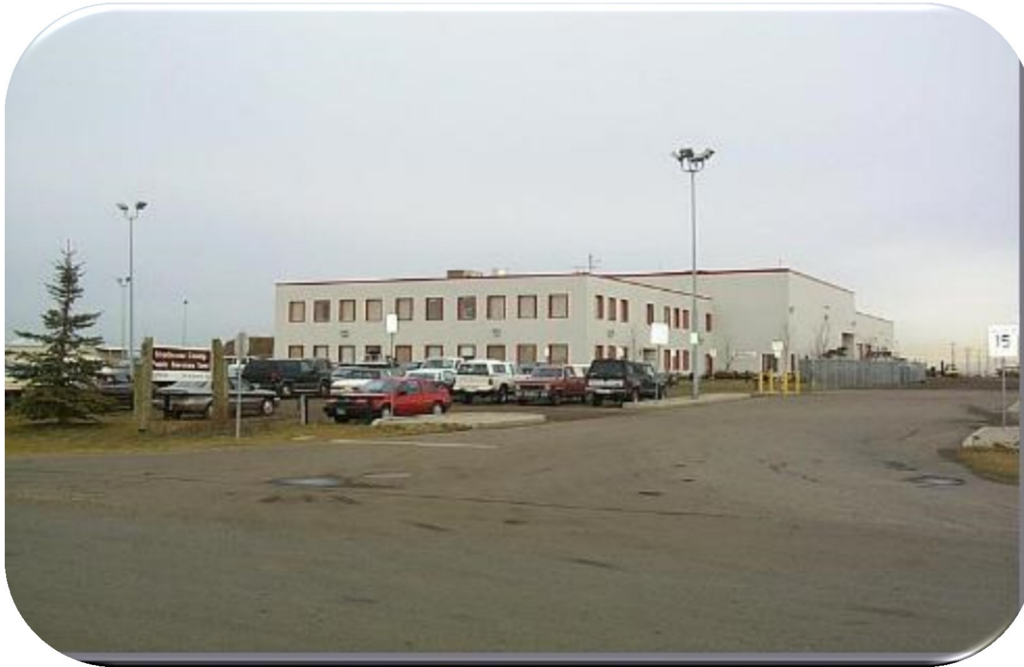
Site of existing facility