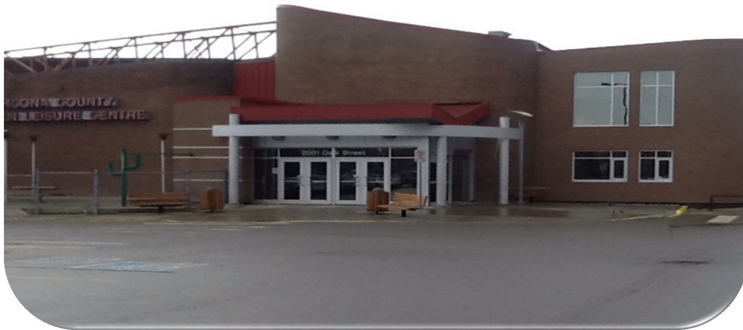
Site of existing facility