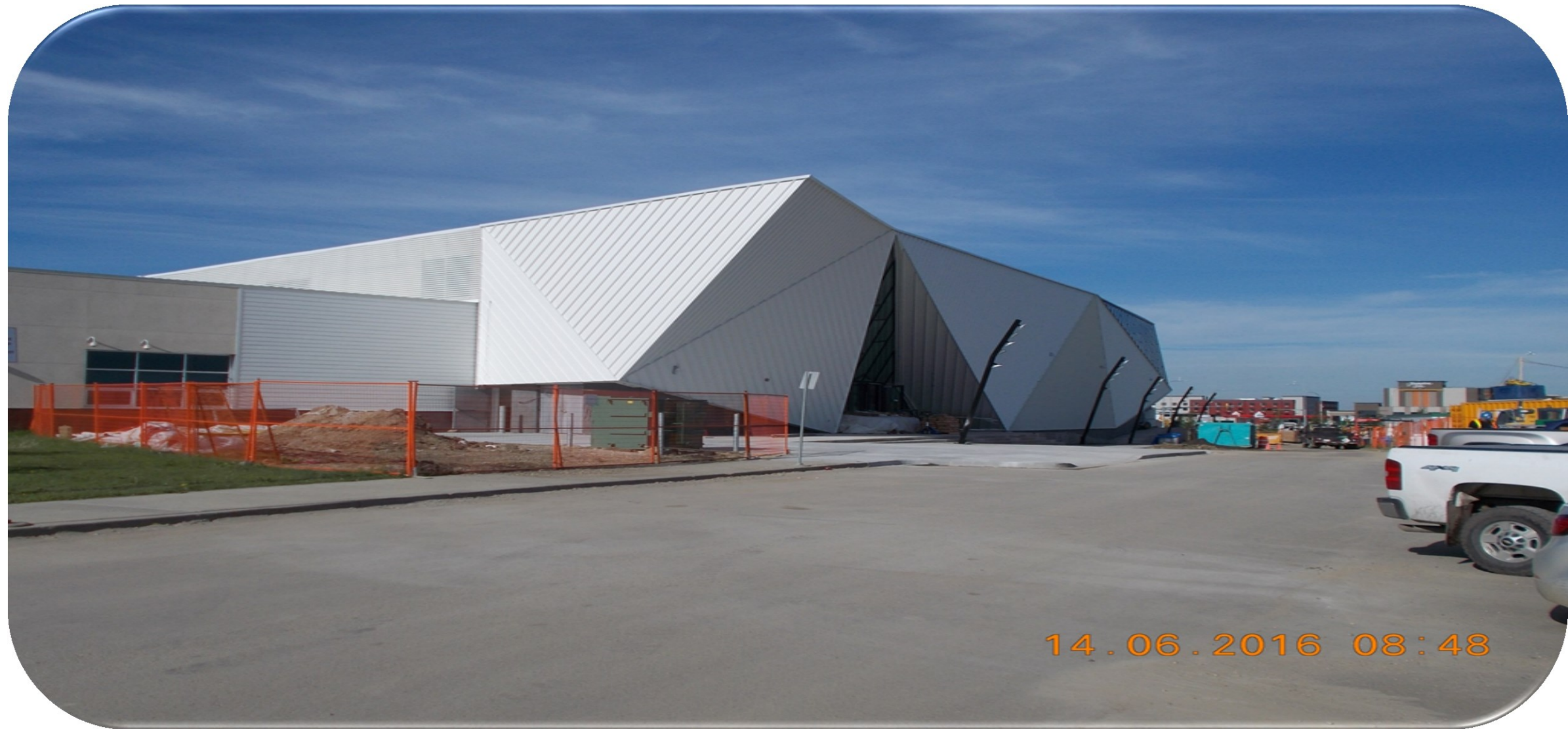
Exterior of new facility