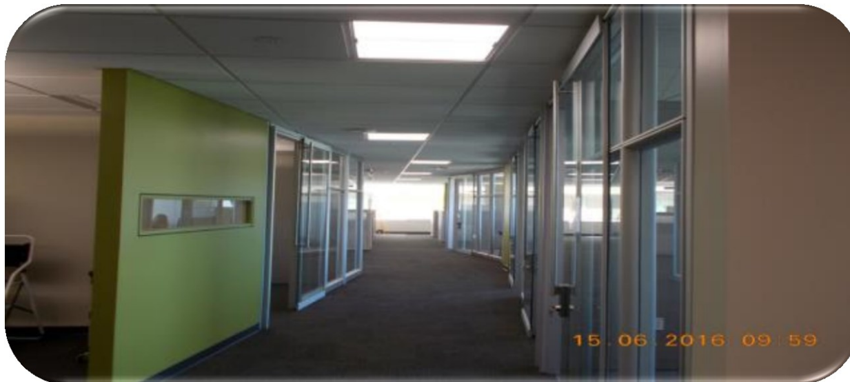
Completed interior of facility