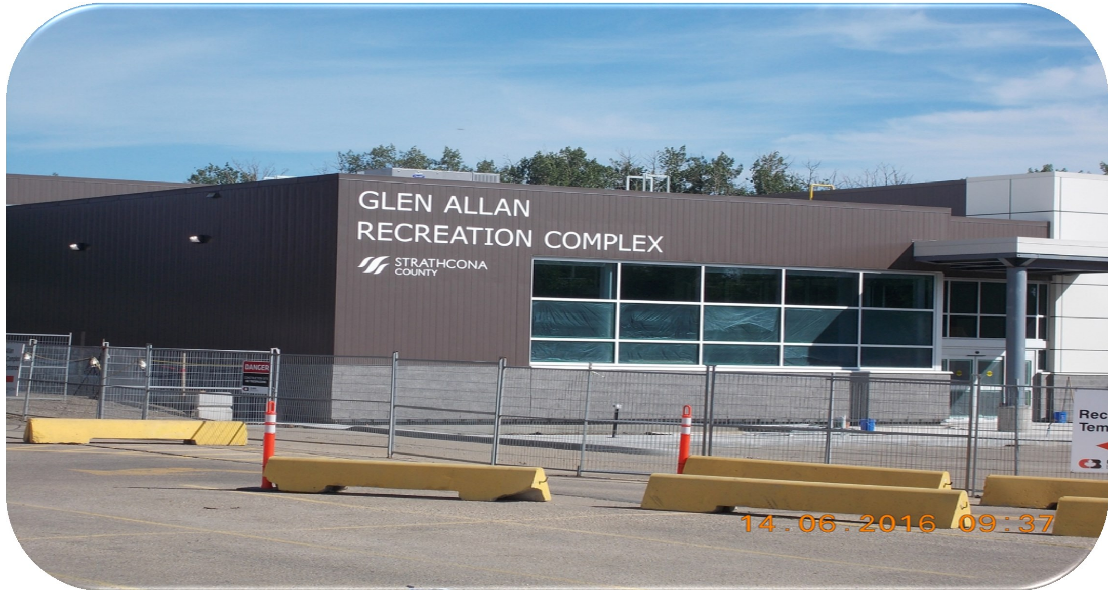
Exterior of facility