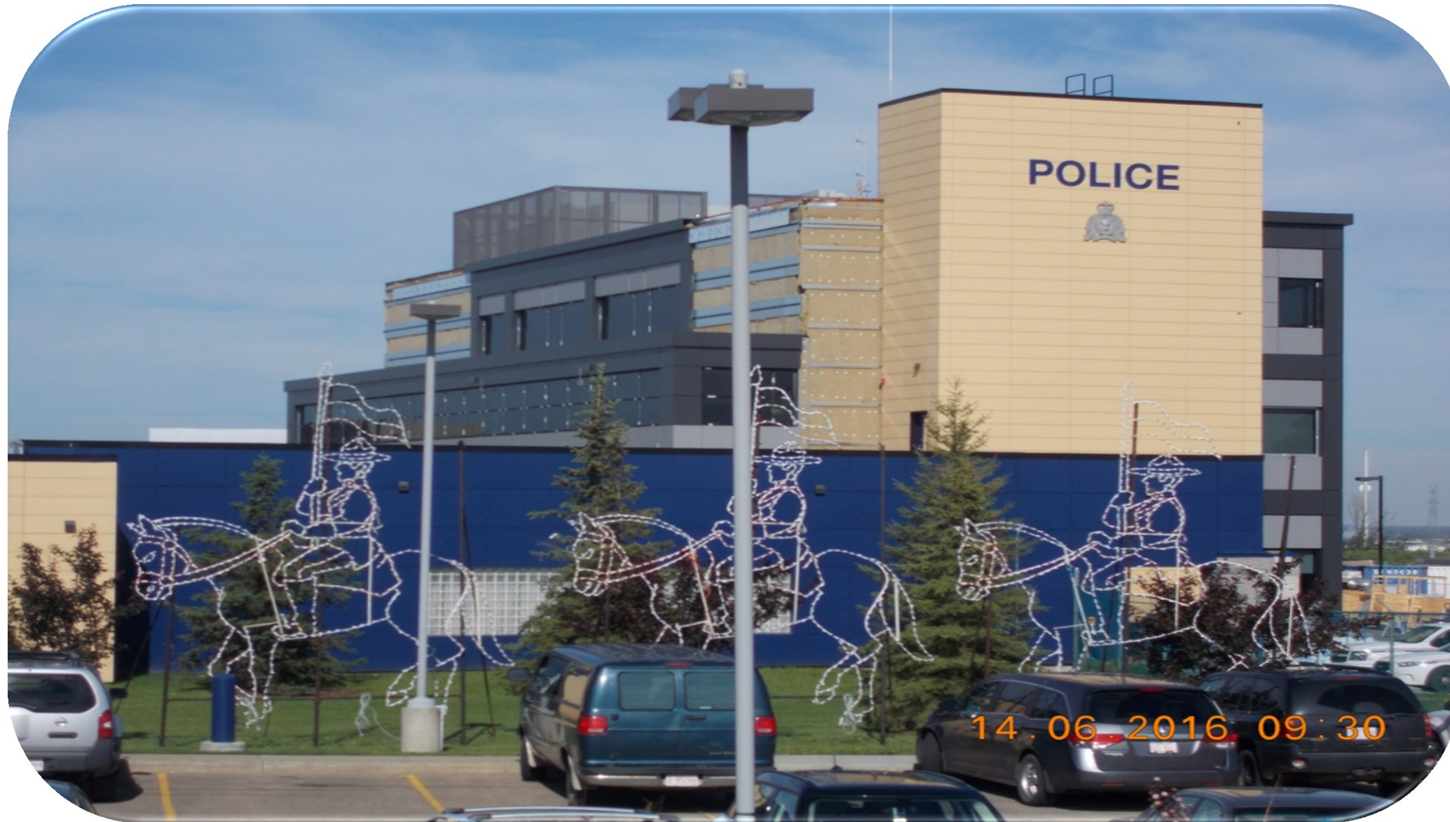
Exterior of facility