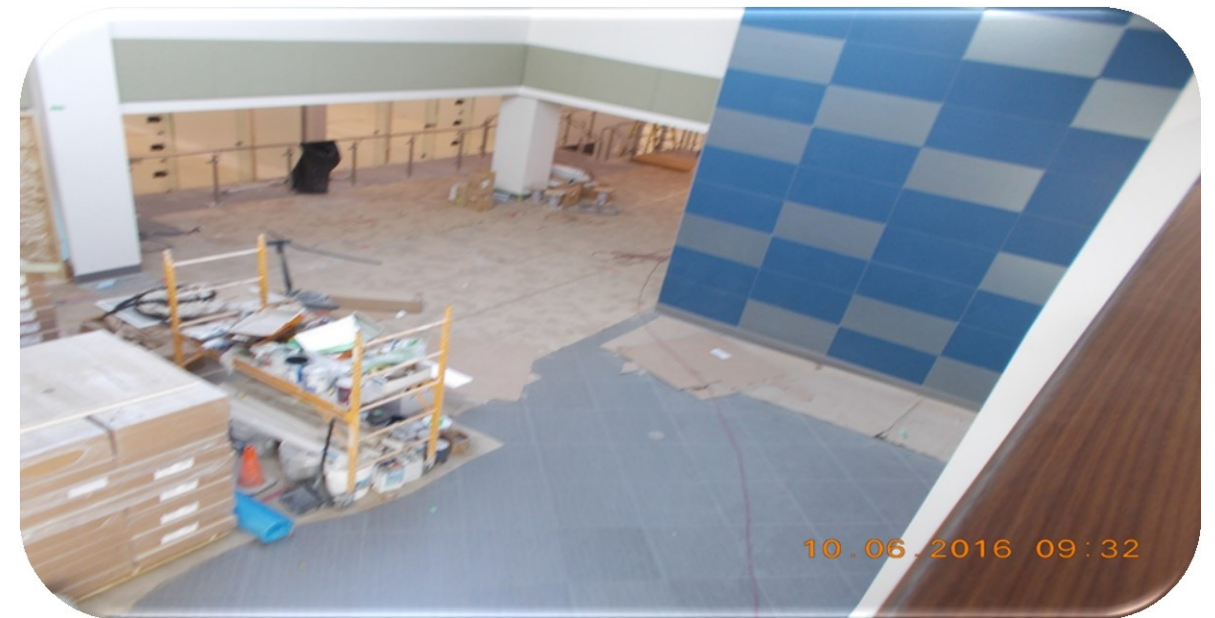
Current interior of facility