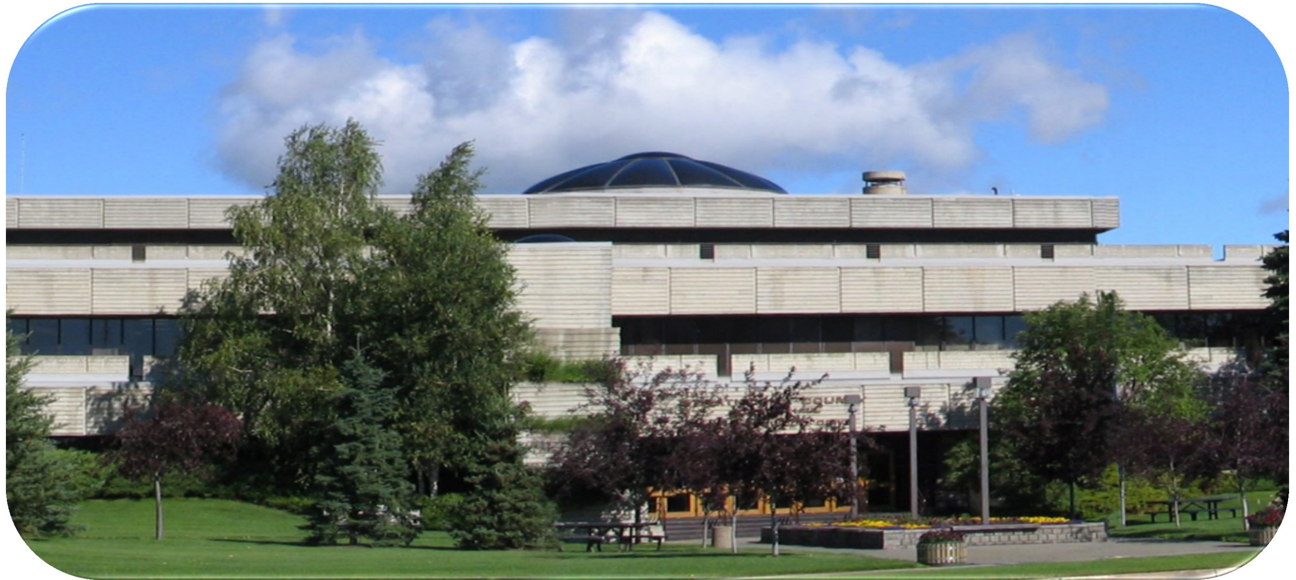
Exterior of existing facility