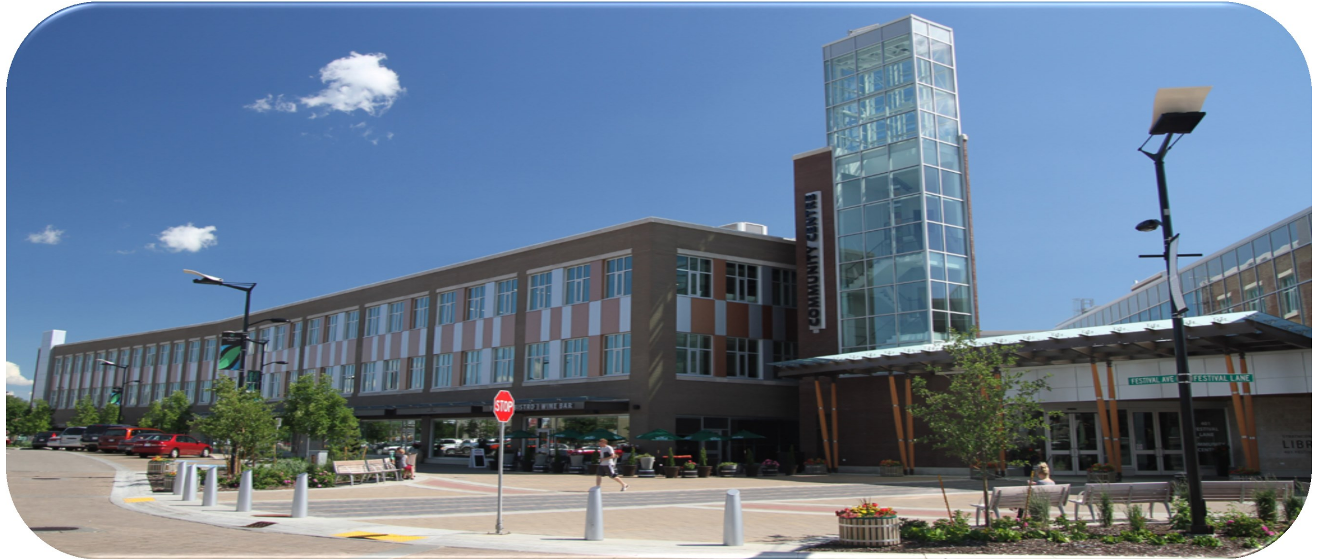
Exterior of facility