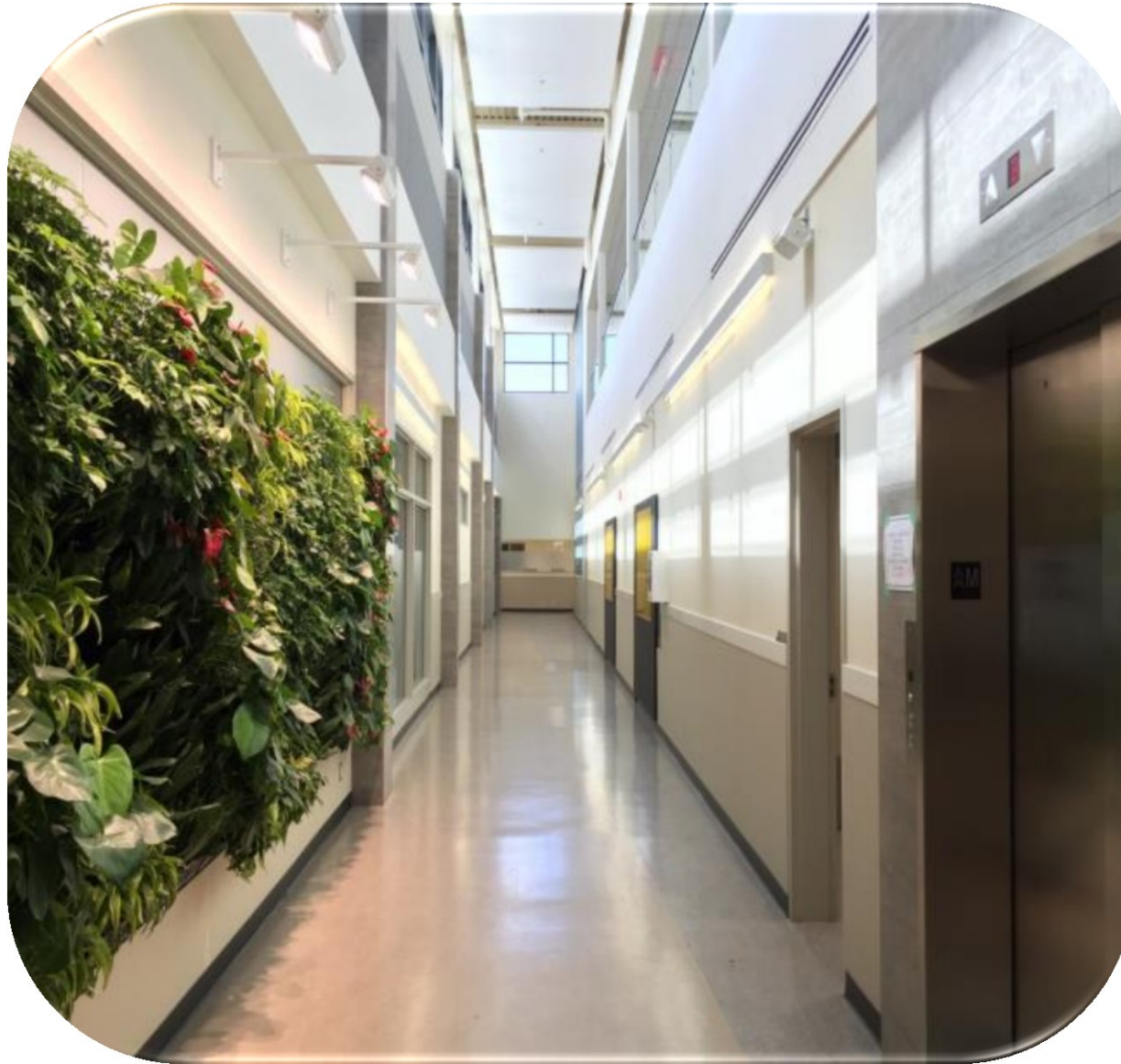
Interior of facility