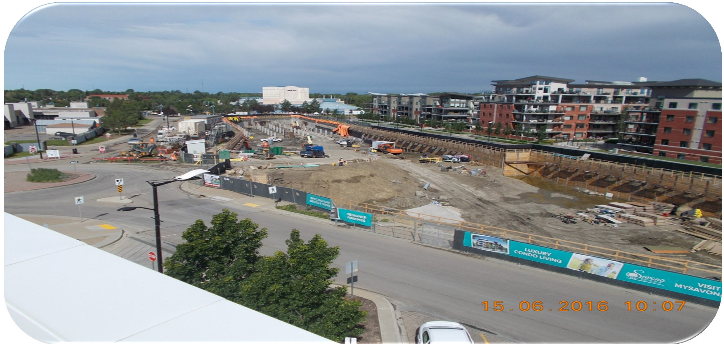
Site of future facility