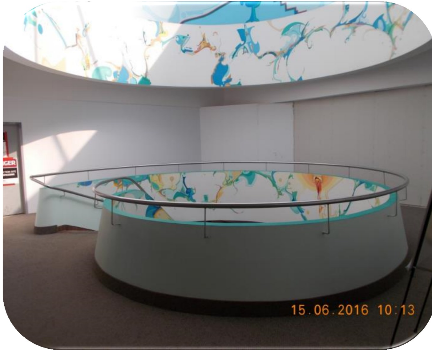
Current interior of facility