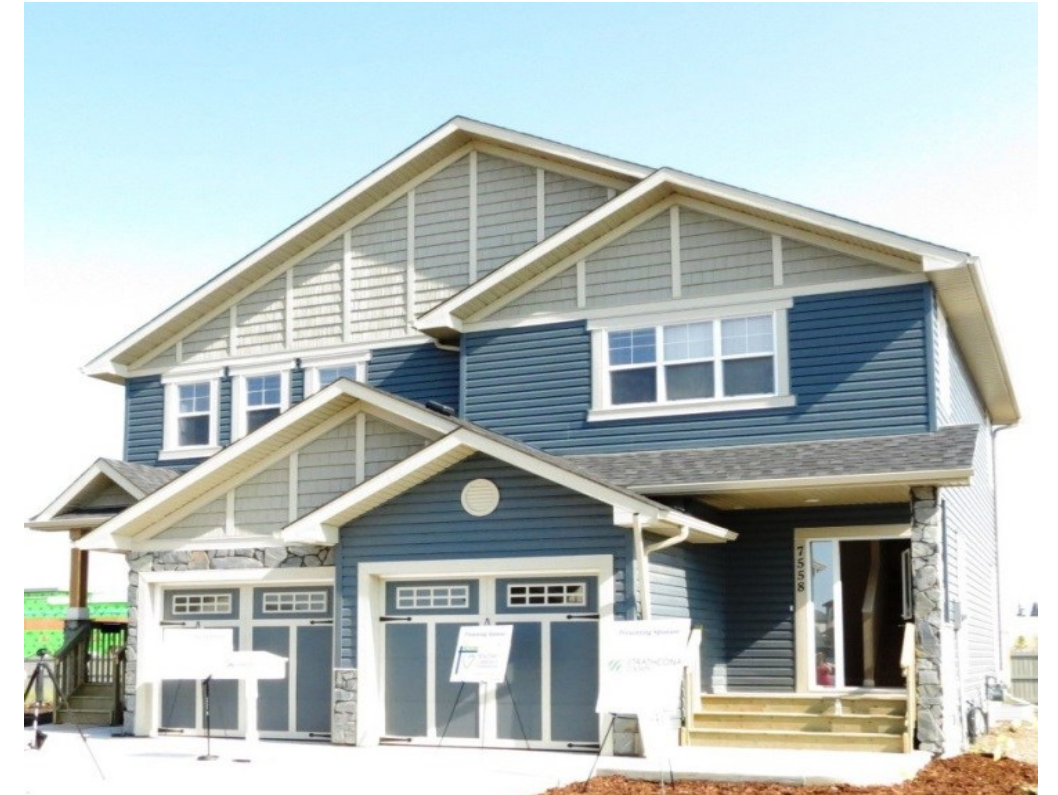
HABITAT HOME IN EMERALD HILLS